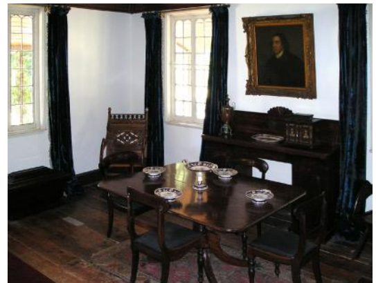
Lyceum Club curtains in the Cottage, 2011

After initial early cleaning by some volunteers last March, further cleaning will be carried out shortly to prepare for the addition of extra shelving, and hooks will be added along with a large two-door