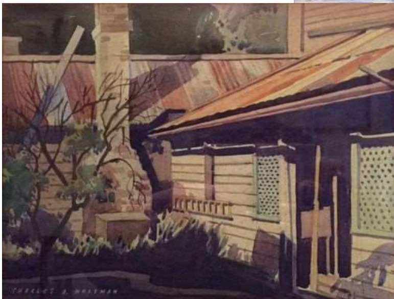
Charles A. Whitman, artist Back verandah La Trobe's Cottage, c.1914 Water colour Private collection