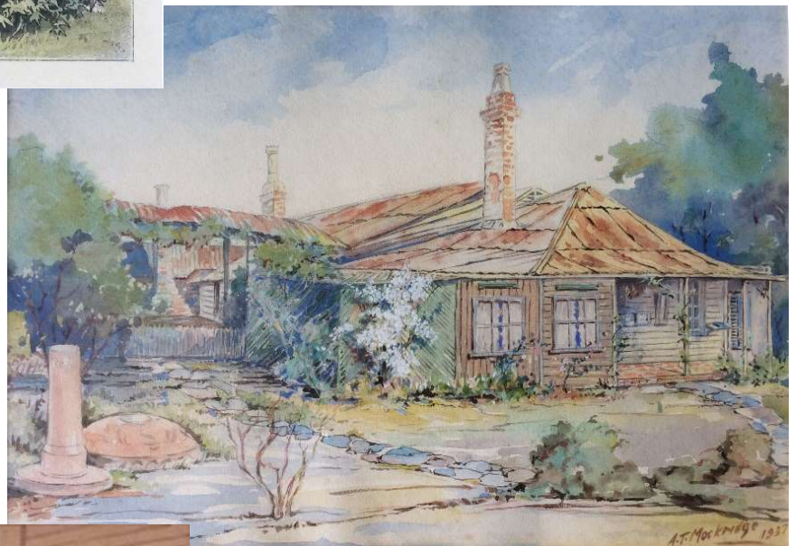
Albert Thomas Mockridge, artist Residence of Governor Charles La Trobe, Jolimont, 1937 Watercolour