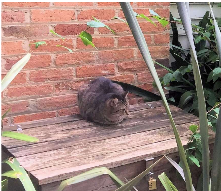
Minnie the cat